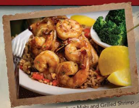
Bourbon Mahi and Grilled Shrimp

Served with Spanish rice and broccoli. $16.99