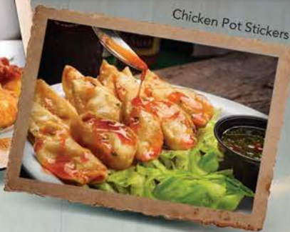
Chicken Pot Stickers

Served with salted pretzel bites for dipping. $4.99