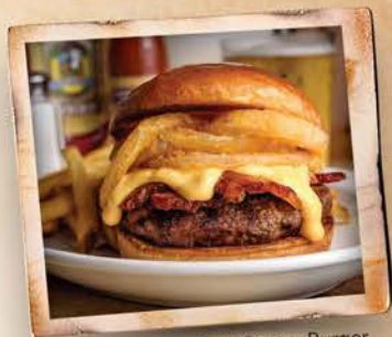
Belly Buster Burger

On rye bread with a side of savory bistro sauce. $8.99