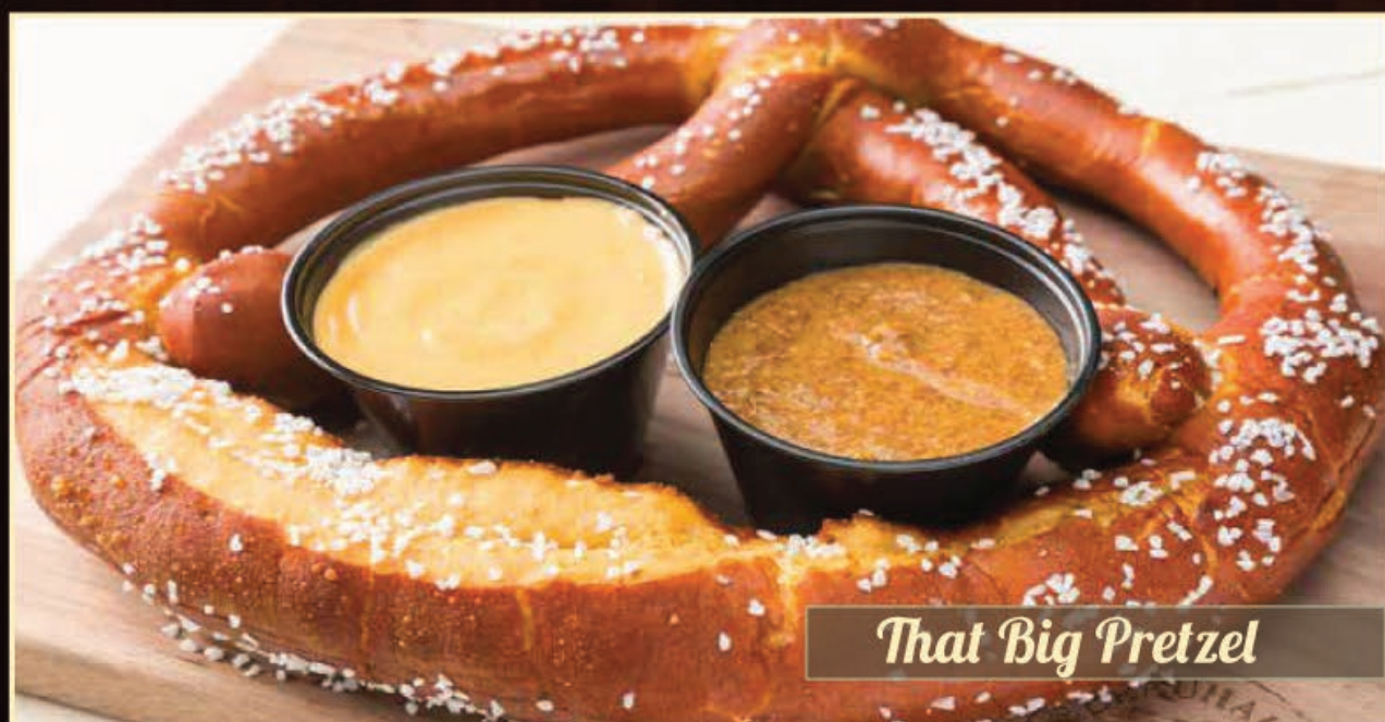
That Big Pretzel

GATOR'S DOCKSIDE - Gator's Signature Item