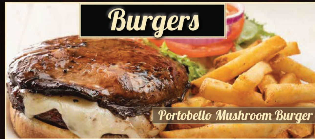
Portobello Mushroom Burger

All burgers are served on your choice of a Kaiser or Brioche Bun and one side item.