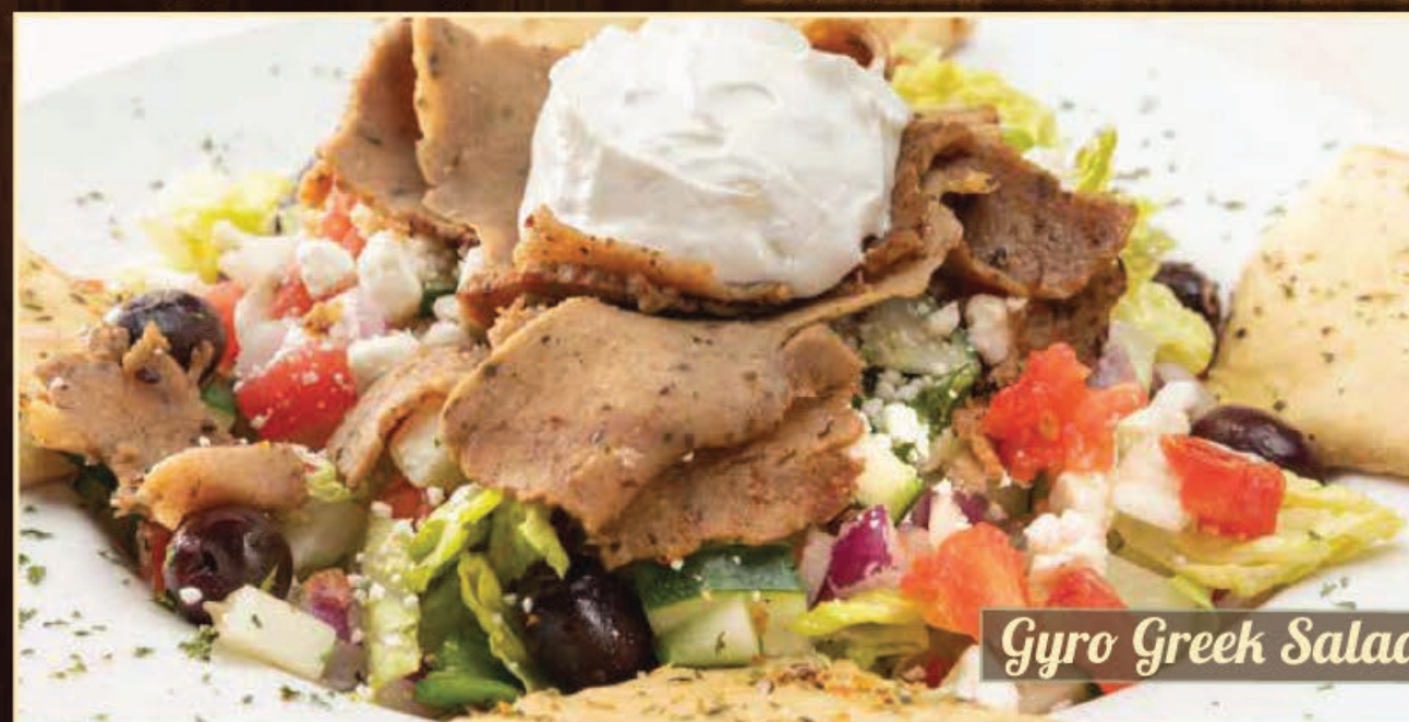
Gyro Greek Salad