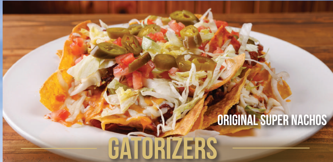
ORIGINAL SUPER NACHOS