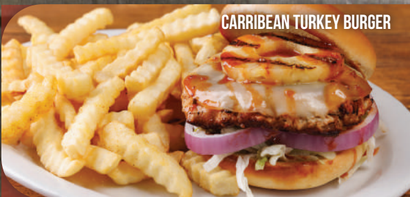
CARRIBEAN TURKEY BURGER

House Side Salad - $3.99 - Caesar Side Salad $3.99