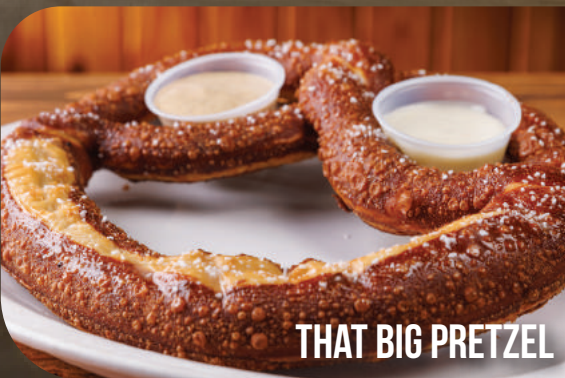
THAT BIG PRETZEL

A warm flour tortilla stuffed with sautéed onions, mixed cheese, and your choice of chicken or steak. Served with sour cream and salsa on the side. $13.99