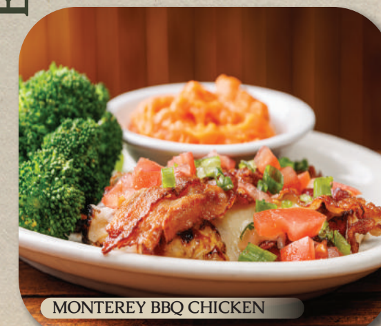
MONTEREY BBQ CHICKEN

Hand-battered cod fried to a golden brown. Served with fries, coleslaw, and tartar sauce. $18.99