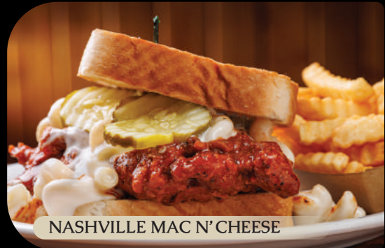
NASHVILLE MAC N' CHEESE