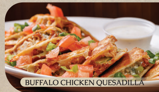
BUFFALO CHICKEN QUESADILLA

Monterey Jack cheese, blue cheese crumbles, celery, and crispy buffalo chicken. Garnished with chopped tomato and green onion. Served with a side of homemade ranch dressing. $14.99