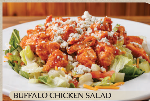
BUFFALO CHICKEN SALAD

*Consuming raw or undercooked meats, poultry, seafood, shellfish, or eggs may increase your risk of foodborne illness, especially if you have certain medical conditions.