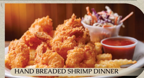
HAND BREADED SHRIMP DINNER