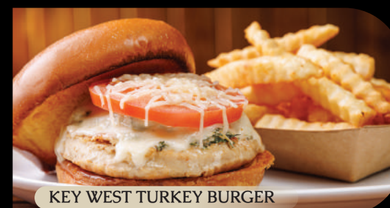
KEY WEST TURKEY BURGER

House Side Salad - Caesar Side Salad - $3.99