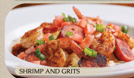
SHRIMP AND GRITS

Add gator tail or additional 1/2 Rack of Ribs for $10.99 Add grilled shrimp for $8.99.