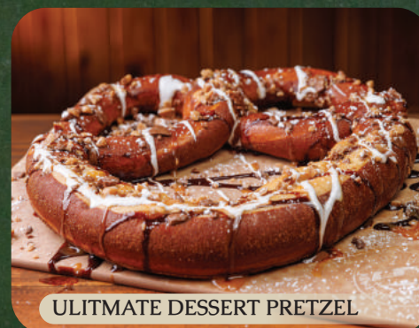
ULTIMATE DESSERT PRETZEL