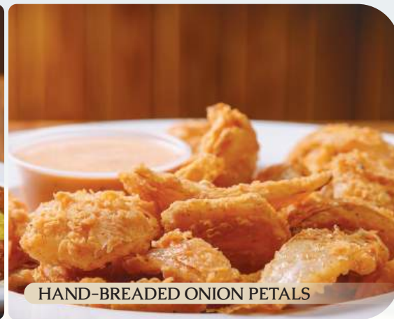
HAND-BREADED ONION PETALS