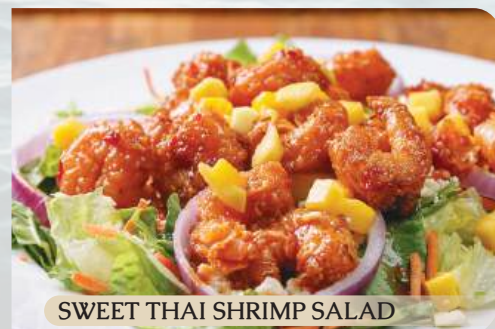
SWEET THAI SHRIMP SALAD

Consuming raw or undercooked meats, poultry, seafood, shellfish, or eggs may increase your risk of foodborne illness, especially if you have certain medical conditions.