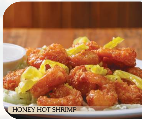
HONEY HOT SHRIMP