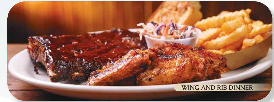
WING AND RIB DINNER

Fresh seasoned burger, topped with bacon, white American cheese, Gator's Own Chipotle Honey BBQ sauce, hand-breaded jalapenos, and onion straws piled high on a toasted bun. $15.99