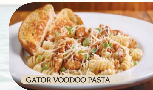
GATOR VOODOO PASTA

Add an additional Half Rack of Ribs for $10.99 Add grilled shrimp or gator tail for $8.99.