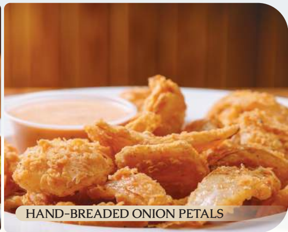
HAND-BREADED ONION PETALS