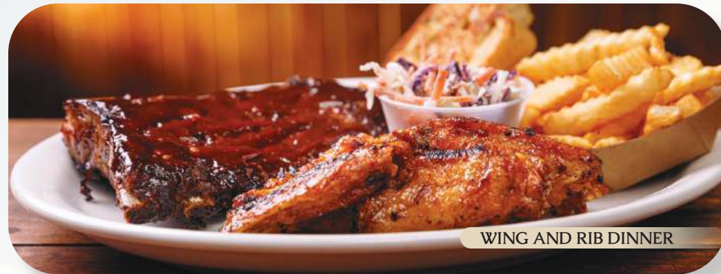
WING AND RIB DINNER

Fresh seasoned burger, topped with bacon, white American cheese, Gator's Own Chipotle Honey BBQ sauce, hand-breaded jalapenos, and onion straws piled high on a toasted bun. $15.99