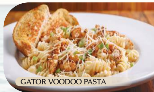
GATOR VOODOO PASTA