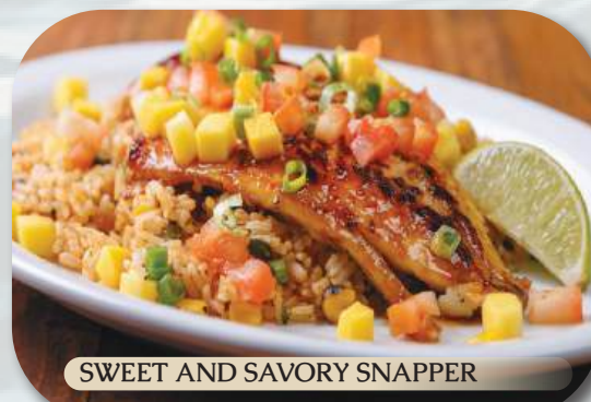
SWEET AND SAVORY SNAPPER

Grilled snapper glazed with honey hot sauce topped with chopped tomato, mango, and green onion. Served over seasoned rice with a lime wedge. $21.99